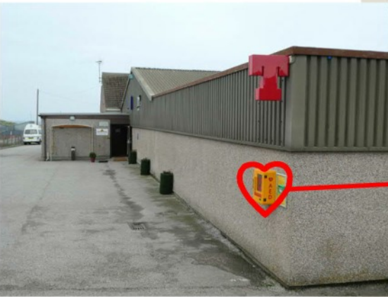
Deveronside Social Club