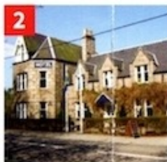
2 Dinnet Rear of the Loch Kinord Hotel, main road. AB34 5JY