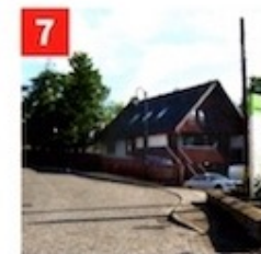
7 Aboyne Side wall of Rose Lodge Nursery, adjacent to the Coop. AB34 5HU