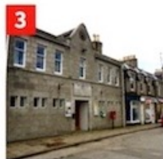
3 Tarland Front wall of MacRobert Hall, village square. AB34 4YL