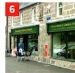
6 Aboyne Front wall of Strachan's shop, village centre. AB34 5HT