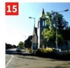
15 Torphins Front porch of Scotmid shop. Only accessible 6am-10pm. AB31 4HE