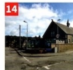
14 Lumphanan Front wall of the village hall, village centre. AB31 4SE