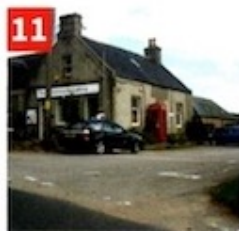
11 Ballogie Garden wall of the Butterworth Gallery. AB34 5DP