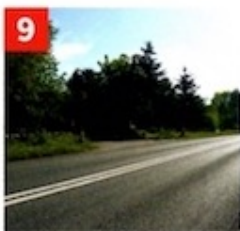
9 Dess Rivendell House, North Deeside Road, east of Aboyne. AB34 5BQ