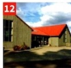
12 Finzean Front wall of the village hall, main road. AB31 6LY