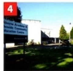
4 Aboyne Front of the Community Centre, Aboyne Academy. AB34 5JN