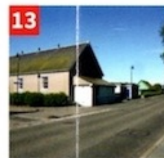
13 Kincardine O'Neil Front porch of the village hall, main road. AB34 5AA