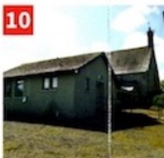
10 Birse North wall of the hall, adjacent to the church. AB34 5BY