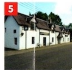
5 Aboyne Through side gate, off car park. Boat inn, Charleston Road. AB34 5EL