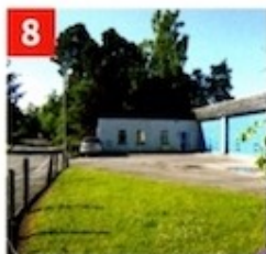
8 Aboyne The Ambulance Station, Bell Wood Road. AB34 5HQ