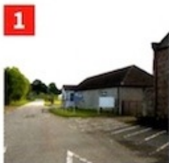
1 Logie Coldstone Front wall of the old pub, village centre. AB34 5PQ